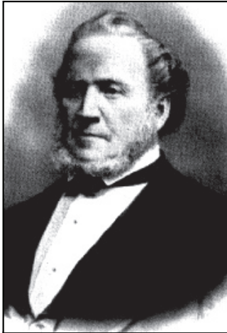
Brigham Young "The Christian world...are heathens as to the knowledge of the salvation of God."

B.H. Roberts served as both LDS Church historian and General Authority. He wrote, "Nothing less than a complete apostasy from the Christian religion would warrant the establishment of the Church of Jesus Christ of Latter-day Saints" ( History of the Church , introduction, p. xl).